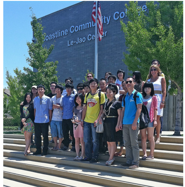
EBUS students at Coastline's Le-Jao Center and ESL Institute in California

On July 3, 2011, twenty-five EBUS students from Xiangjiang High School arrived in California for a five week college and EFL summer program hosted by Coastline Community College and California State University Long Beach (CSULB). The students stayed in dorms on the university campus for a genuine American college experience. They enrolled in either United States History or College Success Skills classes and also took intensive academic English as a Foreign Language courses. Each Friday and Saturday students enjoyed excursions to southern California venues such as Disneyland, Universal Studios and local cultural sites. Before embarking on a weeklong West Coast bus tour that included the Grand Canyon, Las Vegas and San Francisco,