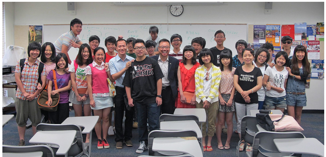
EBUS students were treated to a special guest lecture on the topic of Leadership by Walnut City Mayor Joaquin Lim. Mayor Lim was born in China before immigrating to the United States where he was Mayor for 13 years.

students were honored by CSULB with Certificates of Completion for their hard work in EFL courses. At the ceremony, three EBUS students gave presentations before College and University dignitaries.